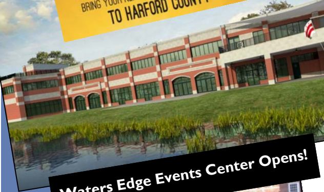
Waters Edge Events Center Opens!