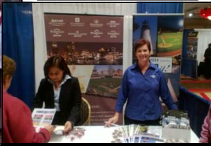
Group Tour Show, NJ