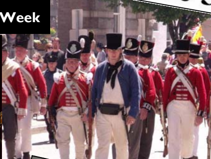
War of 1812

Upper Bay Heritage Attractions & War of 1812 Sites Discovery Guide & Passport