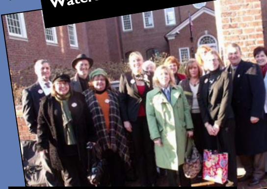
Tourism Day in Annapolis