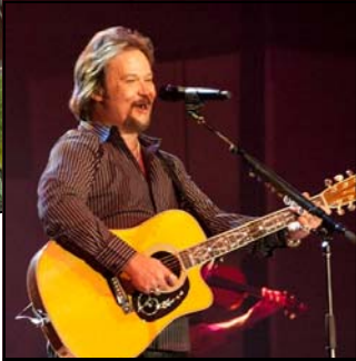
Travis Tritt at APGFCU