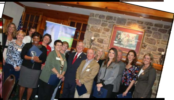
Tourism Advisory Board