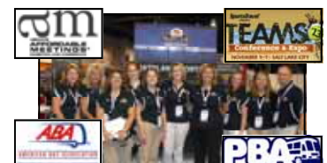
National Trade Shows Targeting Sports & Other Group Markets