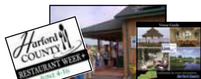
Press Tours, Bus Tours, Special Promotions & Unique Publications