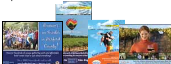
Niche & Cooperative Advertising