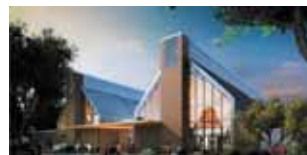
Local Information Centers